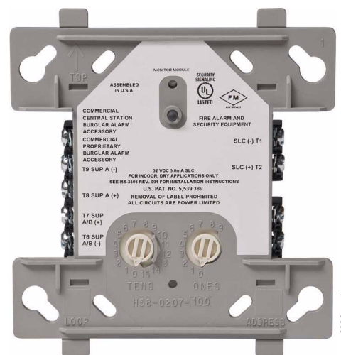
MMF-300 (Type H)

Use to monitor a zone of four-wire smoke detectors, manual fire alarm pull stations, waterflow devices, or other normally-open dry-contact alarm activation devices. May also be used to monitor normally-open supervisory devices with special supervisory indication at the control panel. Monitored circuit may be wired as an NFPA Style B (Class B) or Style D (Class